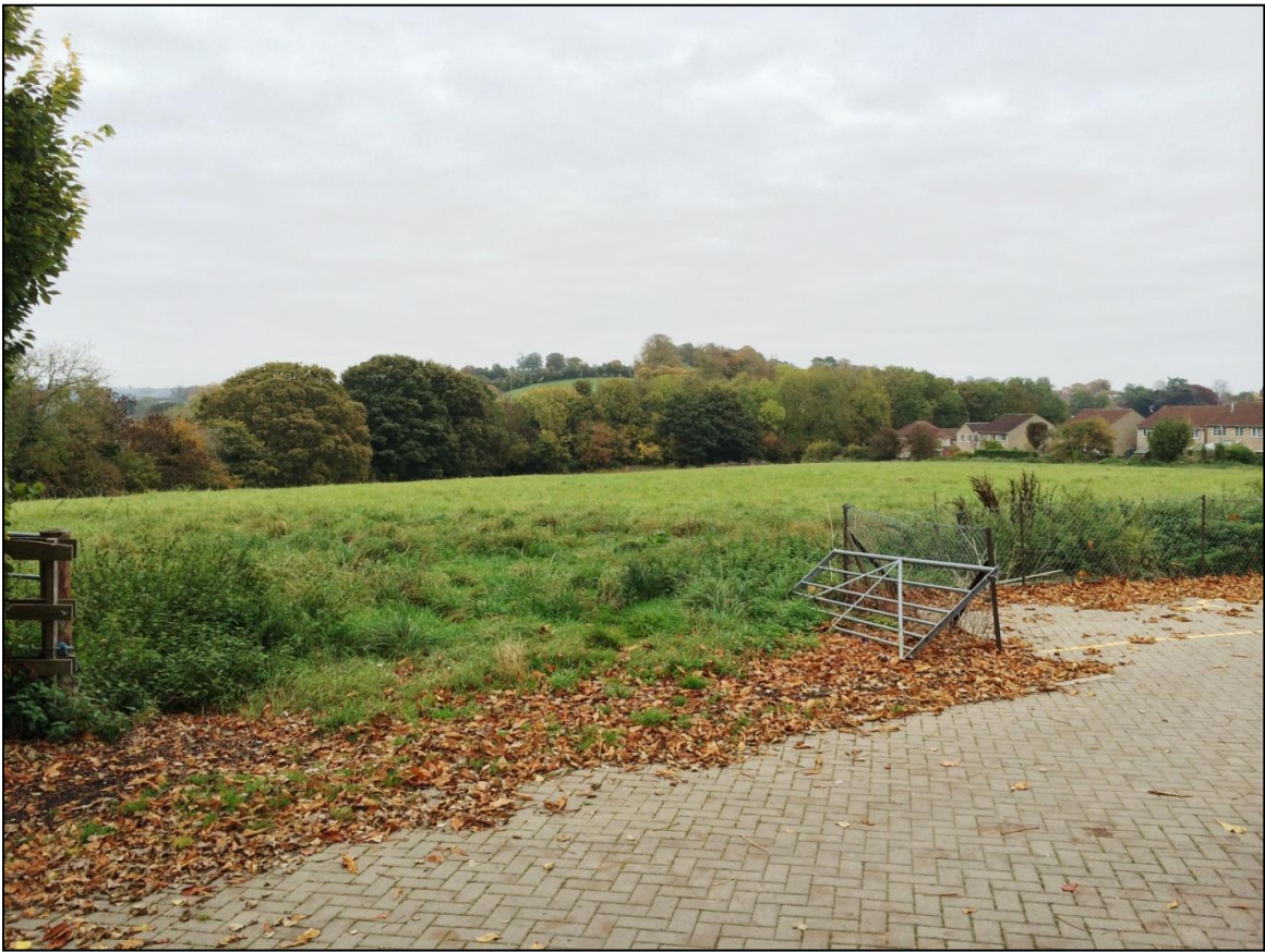
View of site from the northeast

A handwritten signature or logo in green ink, consisting of a stylized, cursive letter 'M'.