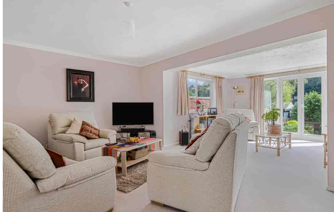
20 Highwoods Drive, Marlow, Buckinghamshire SL7 3PY Guide Price £725,000 - Freehold