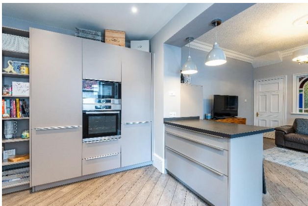
FAMILY LIVING/DINING KITCHEN