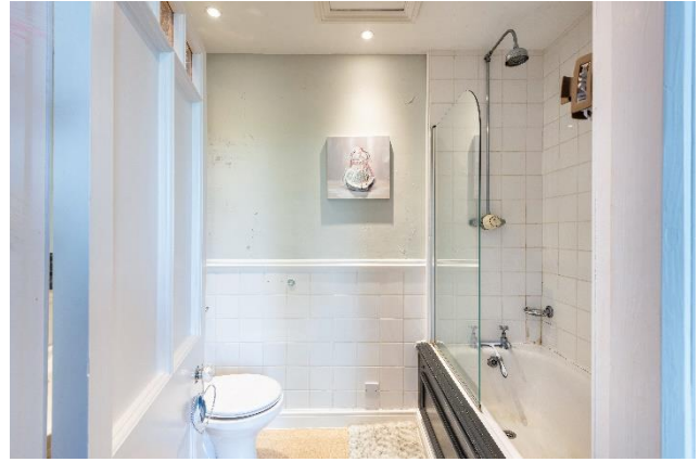
BEDROOM 3 WITH EN-SUITE