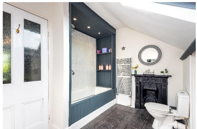
ATTIC BEDROOM WITH EN-SUITE