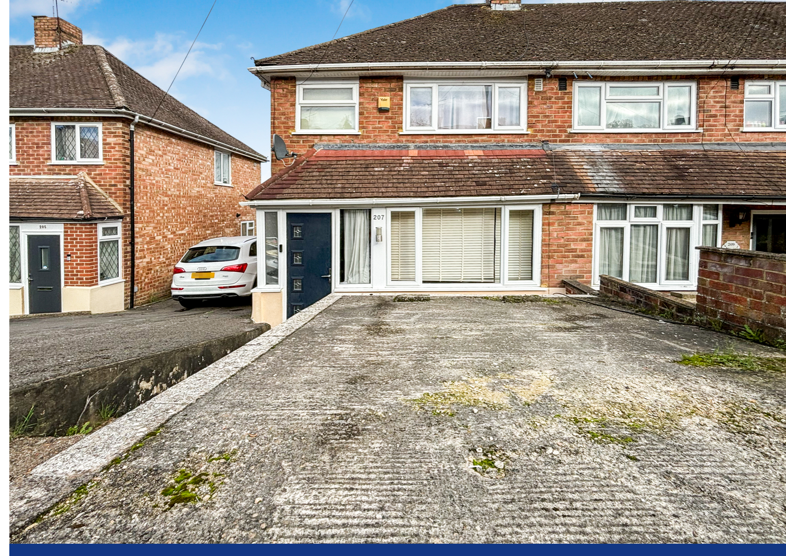
Thirlmere Avenue, Tilehurst, Reading, Berkshire.