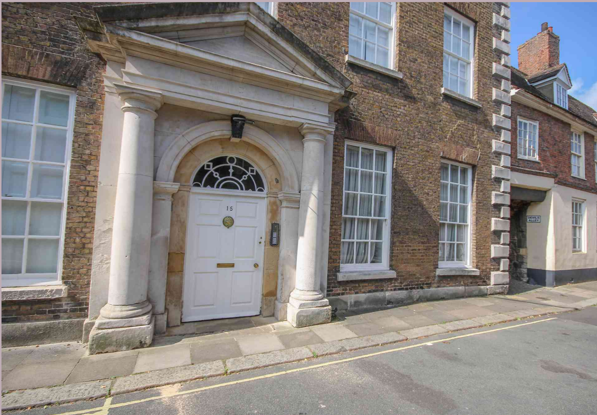
Com Chambers, Lath Mansions, King's Lynn £1,100 per calendar month