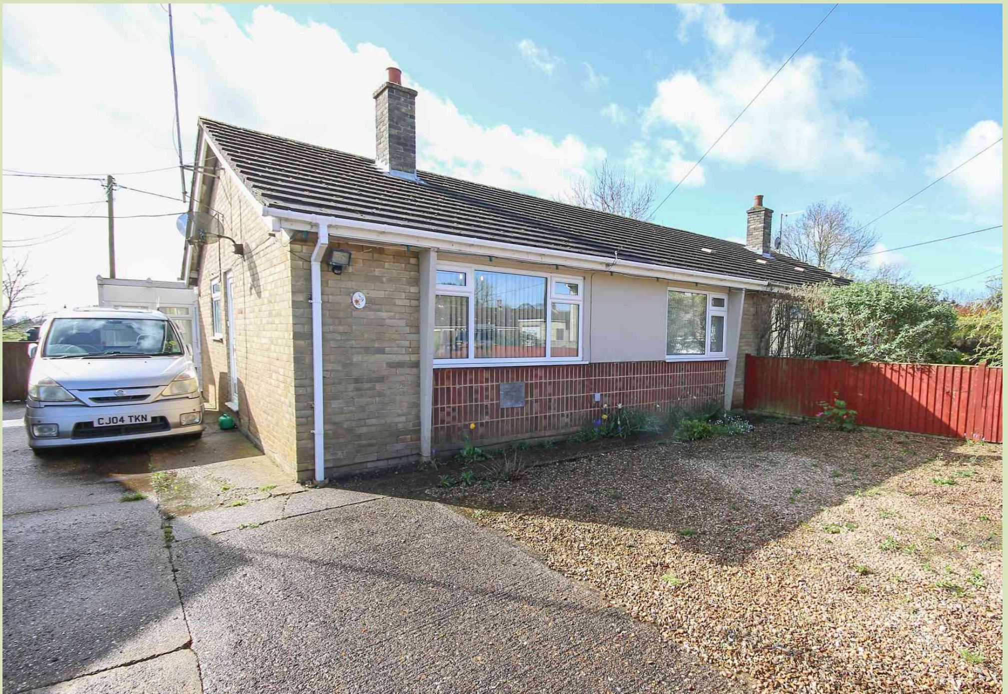
29 Glebe Estate, Tilney All Saints Guide Price £179,950