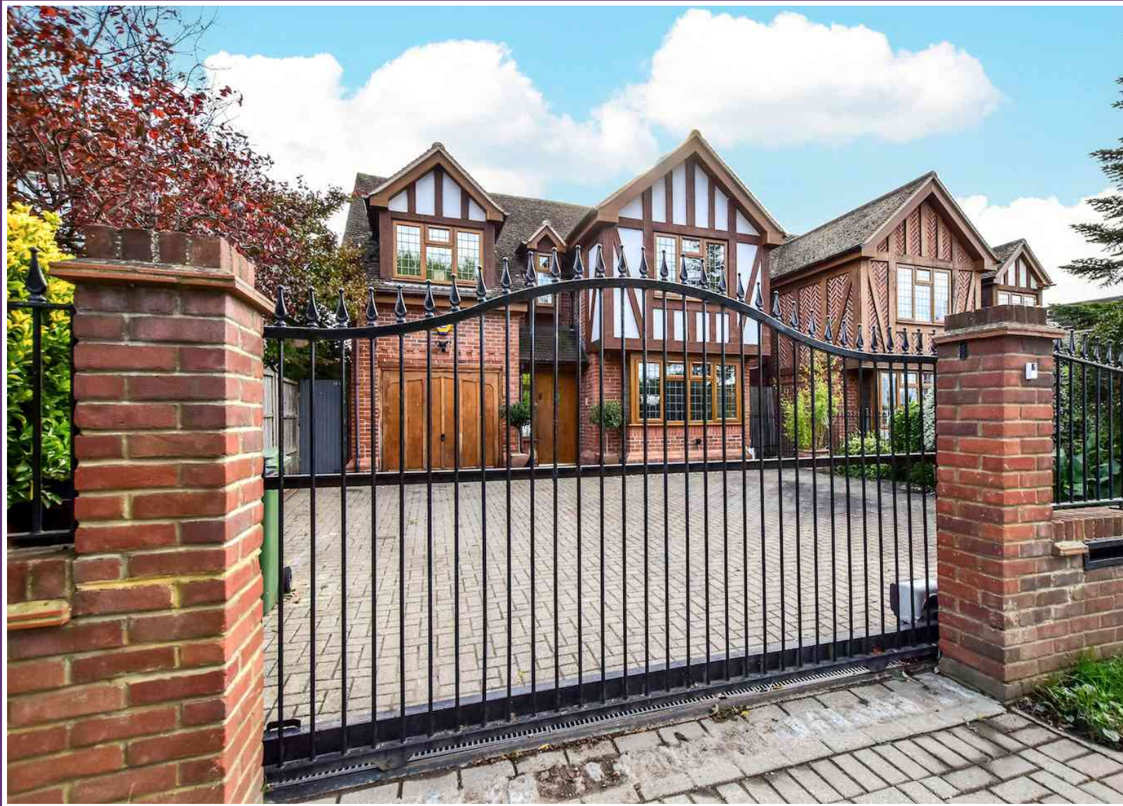
The Old Bakery, Stoke Poges, Buckinghamshire. SL3 6NX.

HILTON KING & LOCKE SPECIALISTS IN PROPERTY