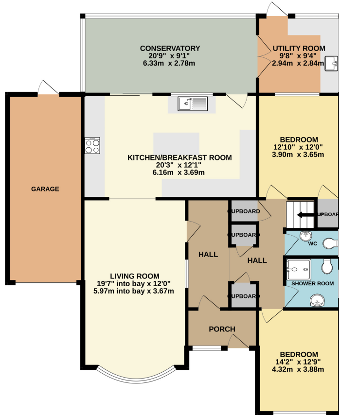
GROUND FLOOR 1450 sq.ft. (134.7 sq.m.) approx.