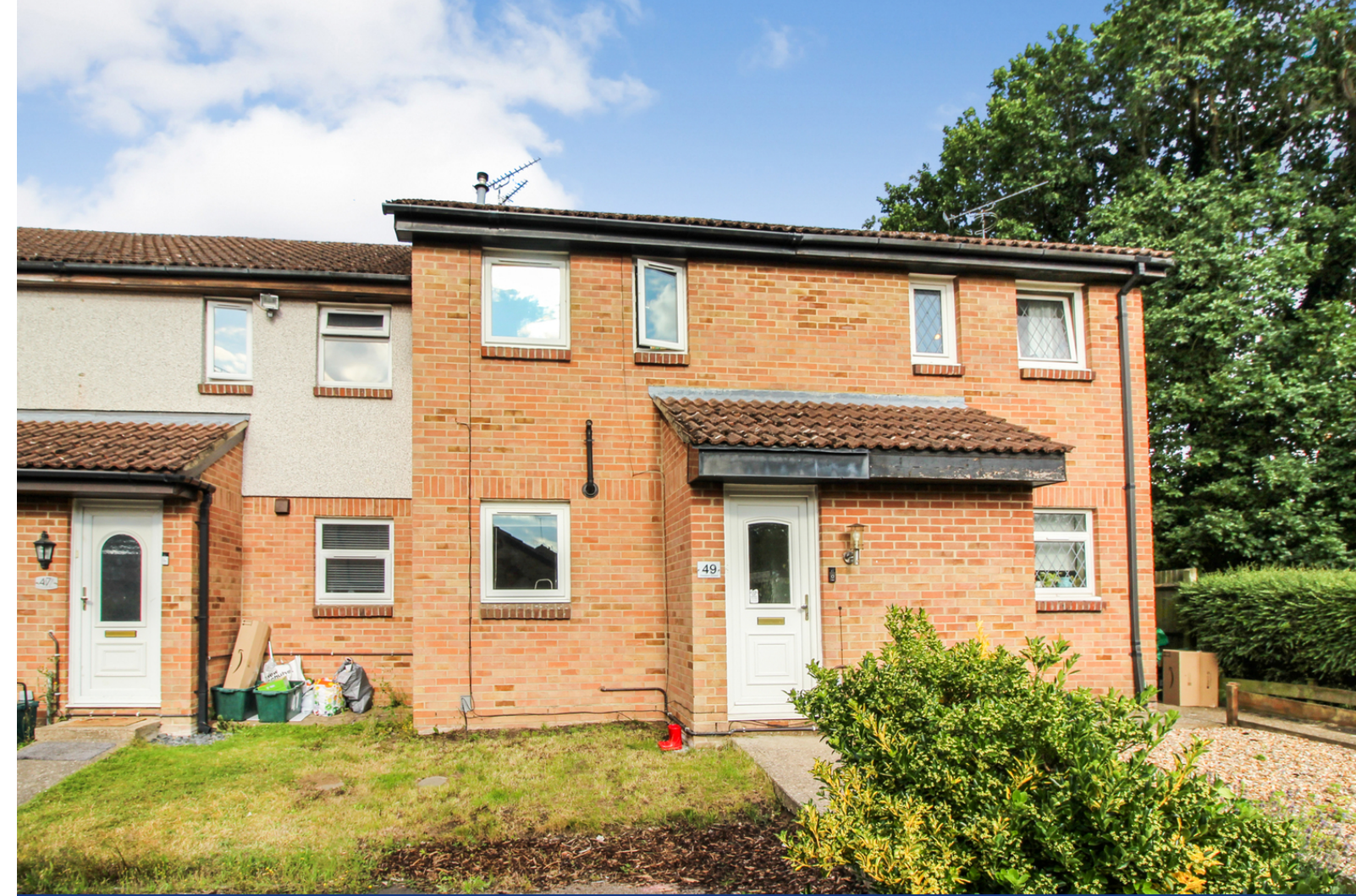
Pemberton Gardens, Calcot, Reading.