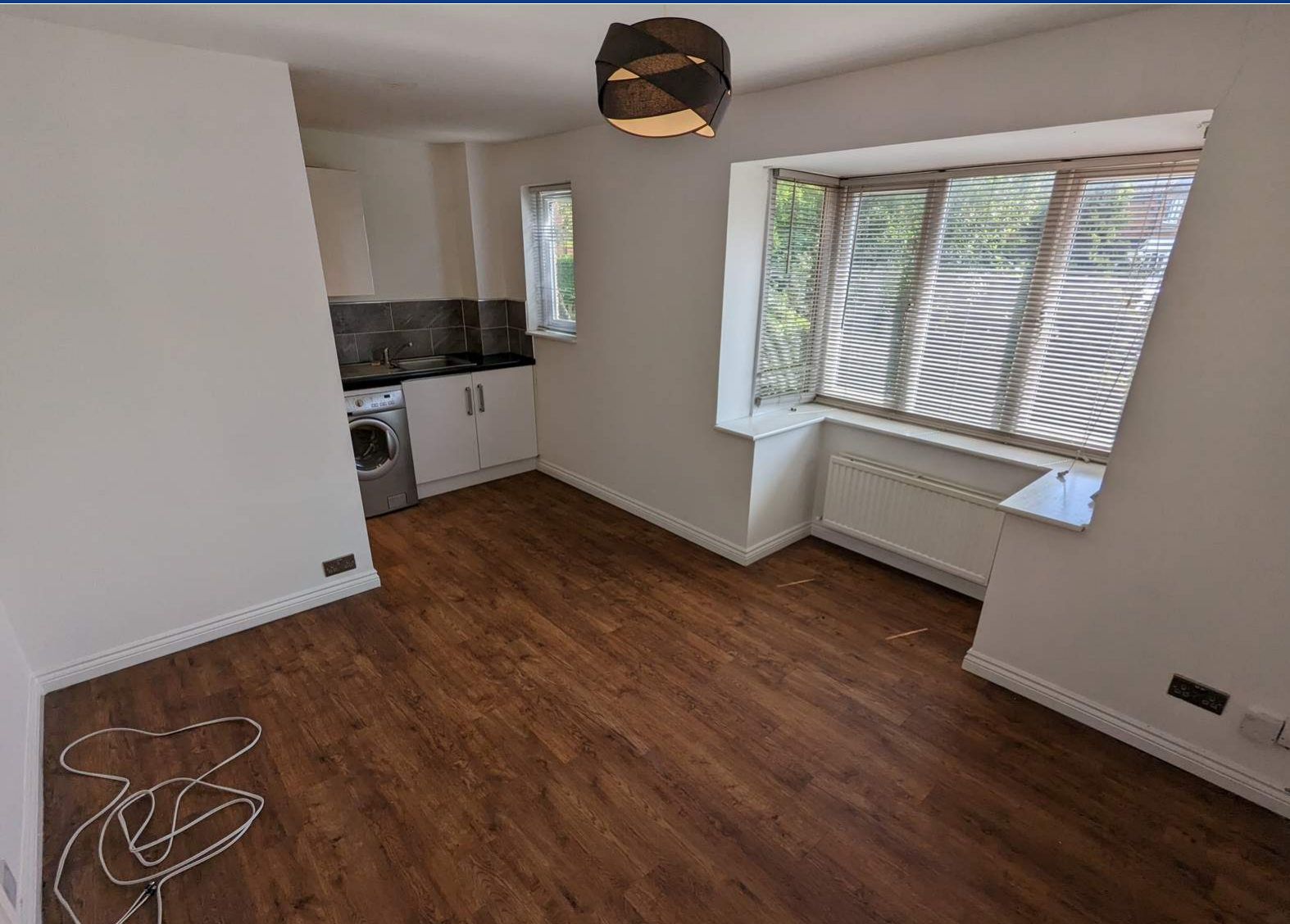
GROUND FLOOR 225 sq.ft. (20.9 sq.m.) approx.

Have you visited our website for our latest property listings? www.arins.co.uk