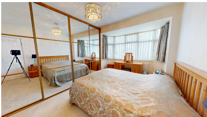
A bedroom with a single bed, a window with lace curtains, a radiator, and a wooden desk with a lamp.

GRADE: 100 FLOOR 1: 56.74 m 2 , FLOOR 2: 46.38 m 2 EXCLUDED AREA: COVERED PORCH: 3.27 m 2 TOTAL: 103.62 m 2 SIZES AND DIMENSIONS ARE APPROXIMATE, ACTUAL MAY VARY