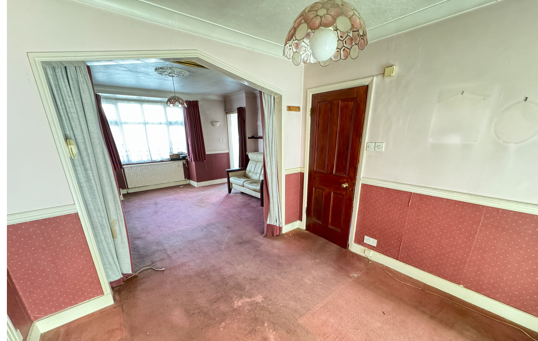
33 Shaftesbury Avenue, Feltham, Greater London TW14 9LN £425,000 - Freehold