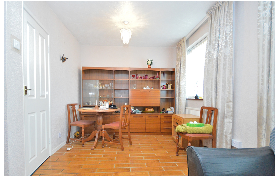
14 Canons Walk, Northampton NN2 8HR £240,000 - Freehold