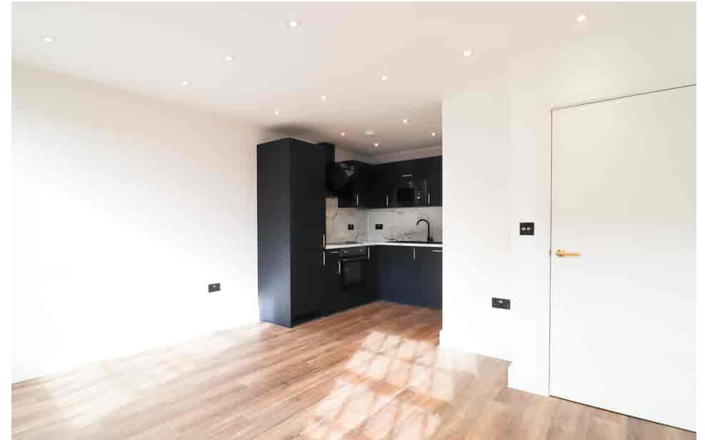
Hawkins Court, Northampton NN1 3LA Offers Over £160,000 - Leasehold