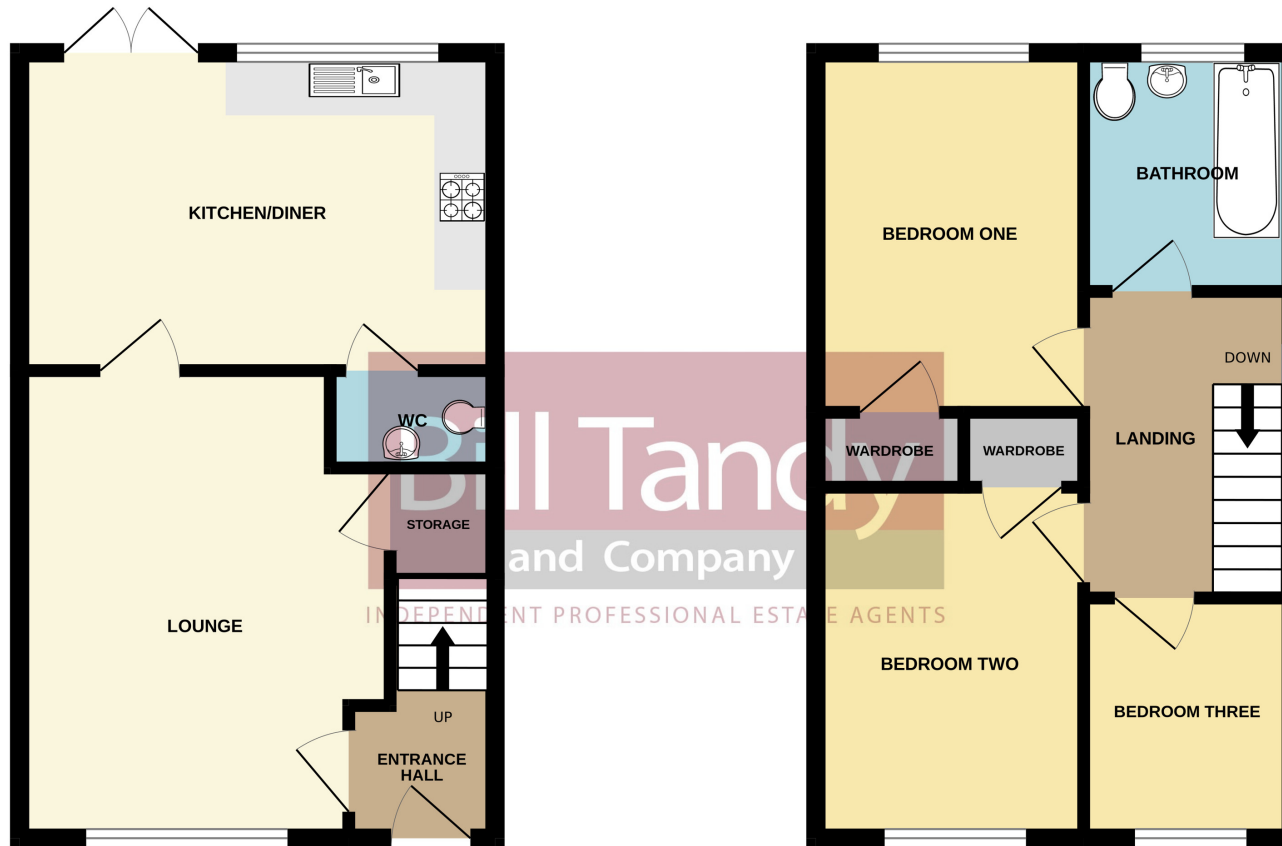
5 FAR LADY CROFT, ARMITAGE, WS15 4FA

Whilst every attempt has been made to ensure the accuracy of the floorplan contained here, measurements of doors, windows, rooms and any other items are approximate and no responsibility is taken for any error, omission or mis-statement. This plan is for illustrative purposes only and should be used as such by any prospective purchaser. The services, systems and appliances shown have not been tested and no guarantee as to their operability or efficiency can be given. Made with Metropix ©2024