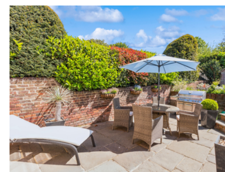
Riverside Cottage, 48 Mill Lane, Welwyn, Hertfordshire, AL6 9ES