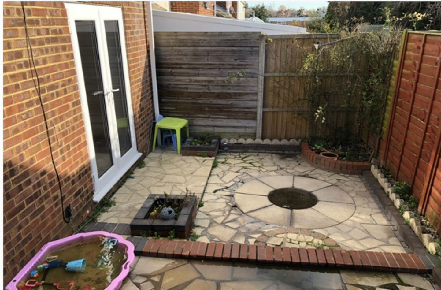
Great location, 2 bedroom home to let.