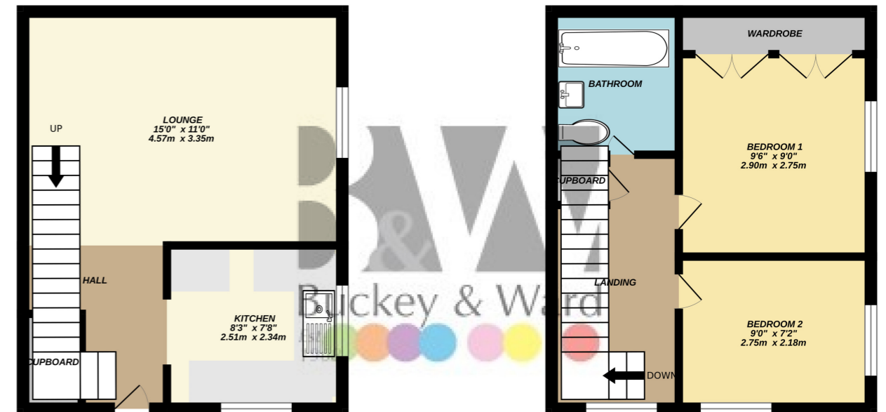
1ST FLOOR 280 sq.ft. (26.0 sq.m.) approx.

TOTAL FLOOR AREA : 560 sq.ft. (52.0 sq.m.) approx. Whilst every attempt has been made to ensure the accuracy of the floorplan contained here, measurements of doors, windows, rooms and any other items are approximate and no responsibility is taken for any error, omission or mis-statement. This plan is for illustrative purposes only and should be used as such by any prospective purchaser. The services, systems and appliances shown have not been tested and no guarantee as to their operability or efficiency can be given. Made with Metropix ©2024