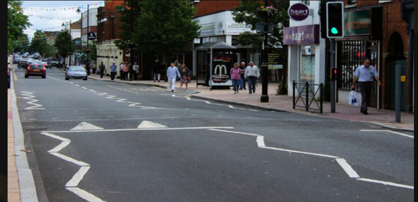
Fleet High Street