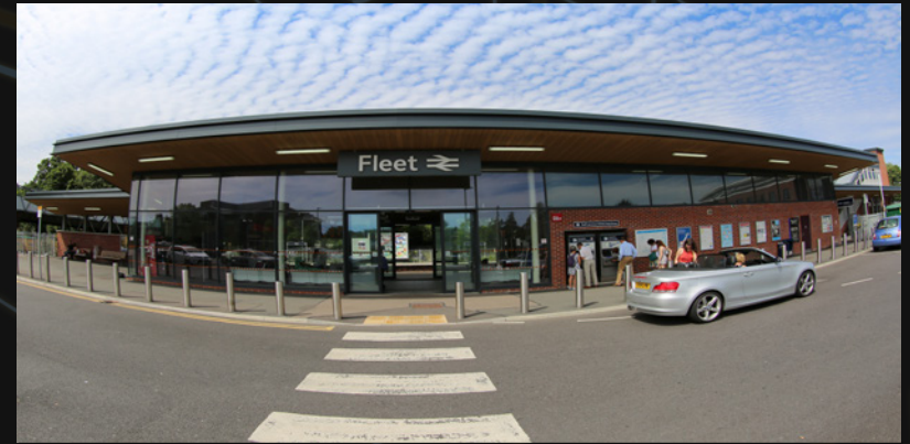
Fleet Mainline Railway Station