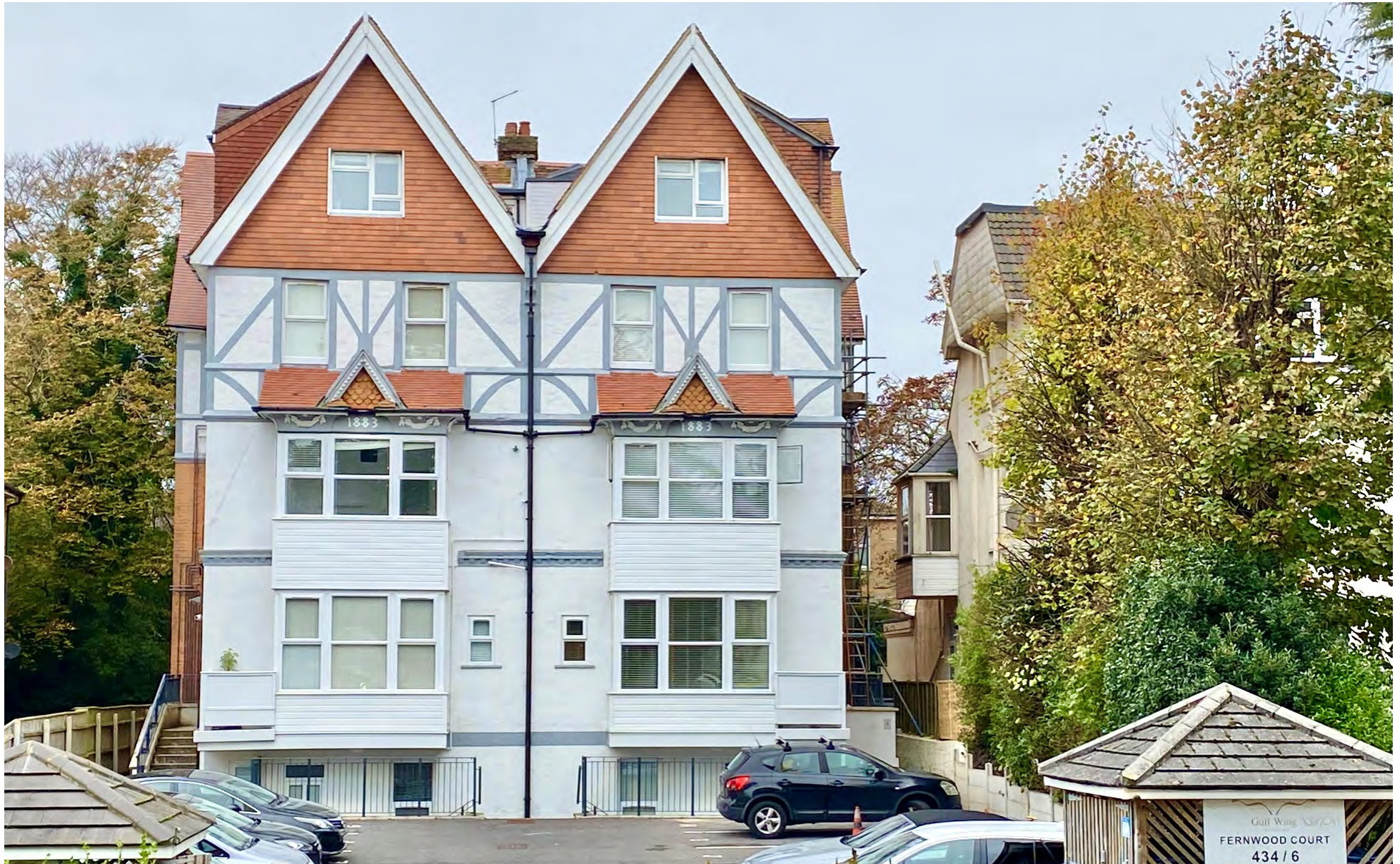
Fernwood Court, 434 - 436 Christchurch Road, Bournemouth BH1 4FJ