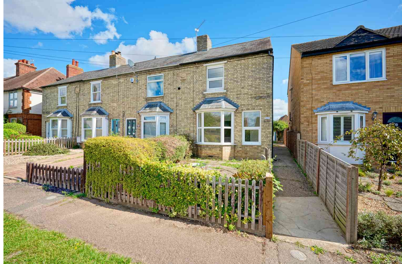
Sapley Road, Hartford PE29 1YG Guide Price £365,000