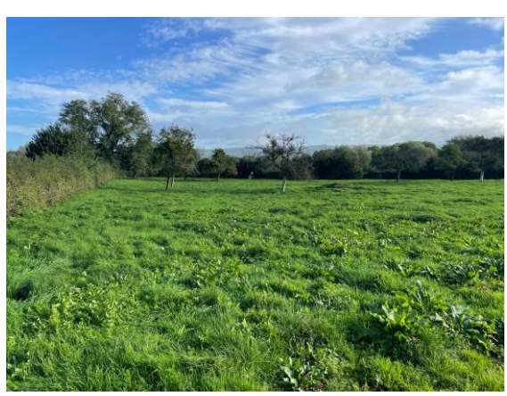
Auction Guide Price £50,000 to £70,000*

Wednesday 15<sup>th</sup> May 2024, 12 midday The Theatre, The Royal Bath and West Showground, Shepton Mallet, BA4 6QN Bid remotely via Livestream, in person or by proxy.