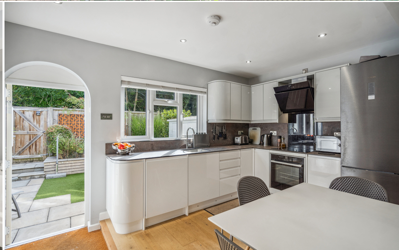
Dellside Harefield, Middlesex, UB9 6AX