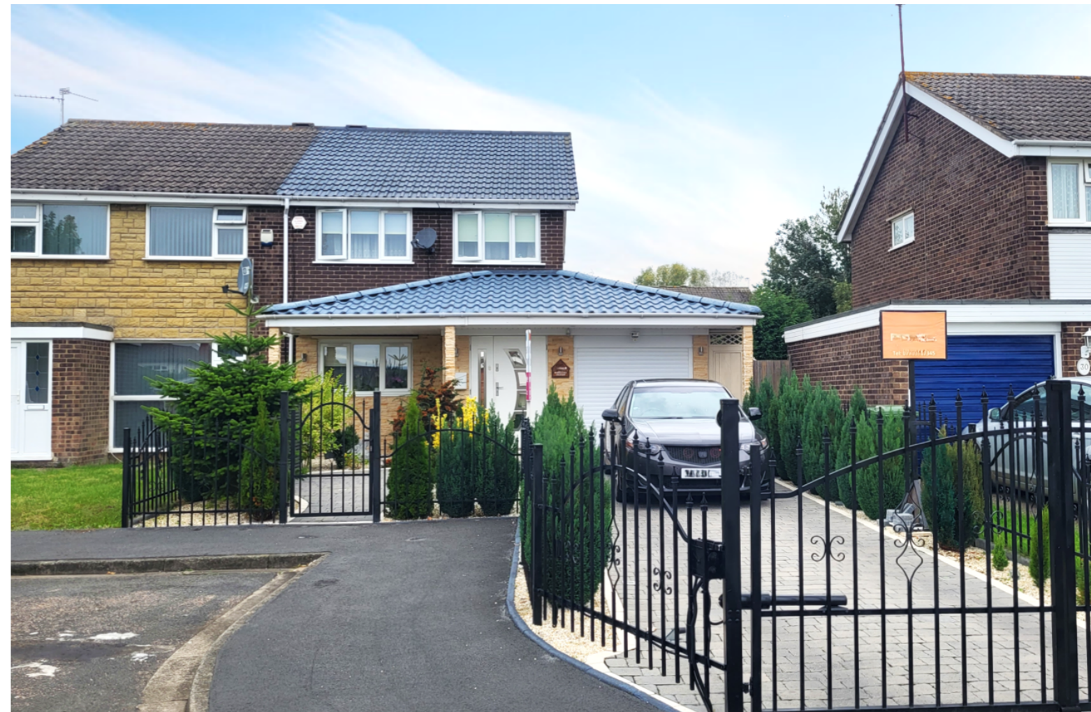
32 Dorchester Crescent, Peterborough PE1 4RP