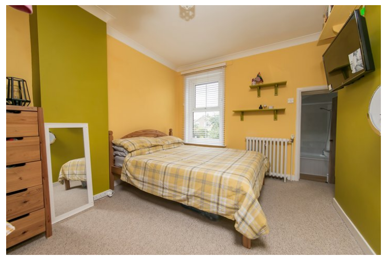
12' 0" x 9' 5" (3.66m x 2.87m) Window to rear, radiator, over stairs storage cupboard and door to.