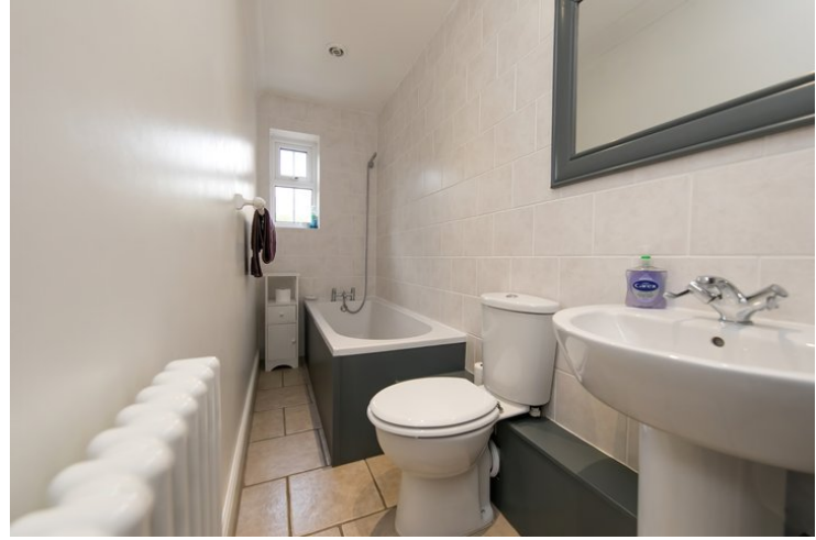
Window to rear, panel bath, close coupled WC, pedestal wash hand basin, tiled floor, tiled walls, radiator.