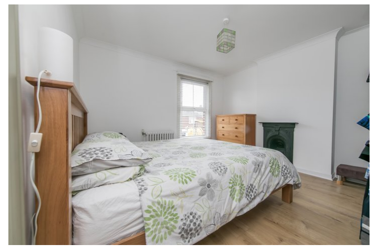
12' 3" x 12' 1" (3.73m x 3.68m) Window to front, radiator, wood flooring, cast iron fireplace.