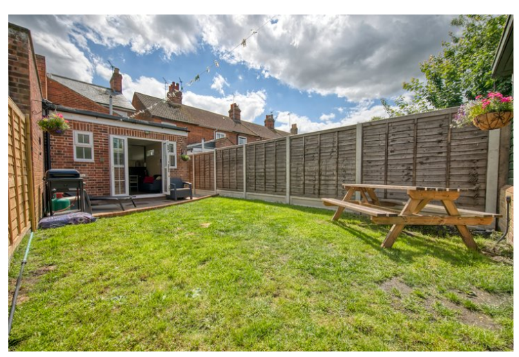
Enclosed by fencing and mainly laid to lawn, sandstone patio area, garden shed, gated side access.