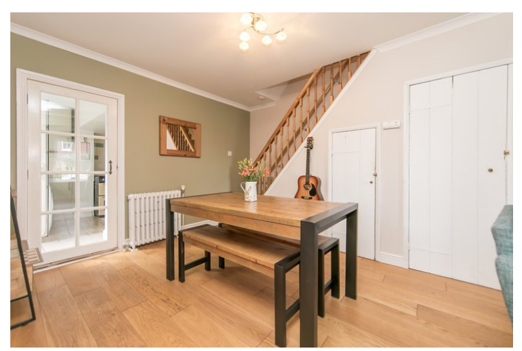
12' 3" x 12' 1" (3.73m x 3.68m) Window to side, oak flooring, radiator, stairs to first floor with storage cupboards under, further cupboard and glazed door to.