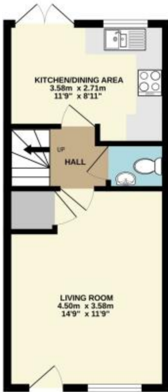
GROUND FLOOR 29.5 sq.m. (317 sq.ft.) approx.