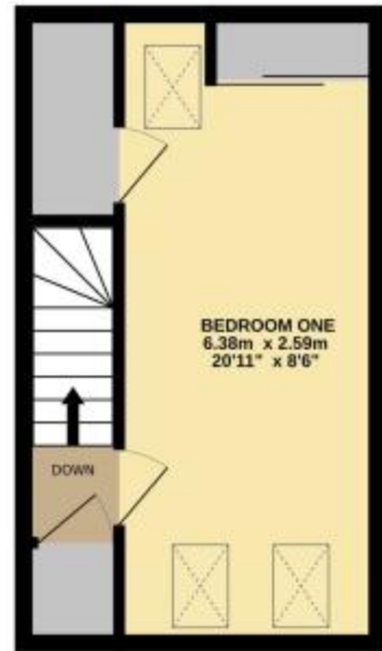
2ND FLOOR 22.9 sq.m. (246 sq.ft.) approx.