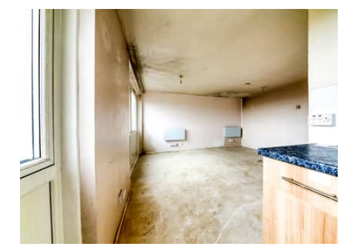
Menlo Gardens, London, SE19