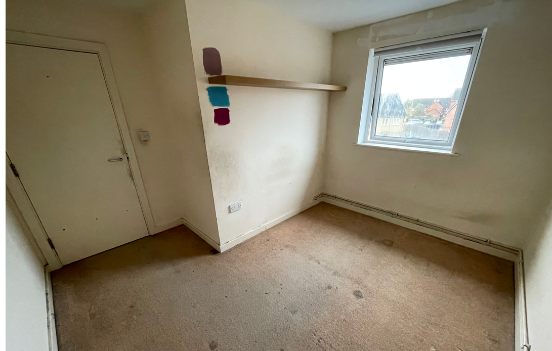
Flat 7 Puccinia Court, Yeoman Drive, Stanwell TW19 7TX £244,950 - Leasehold