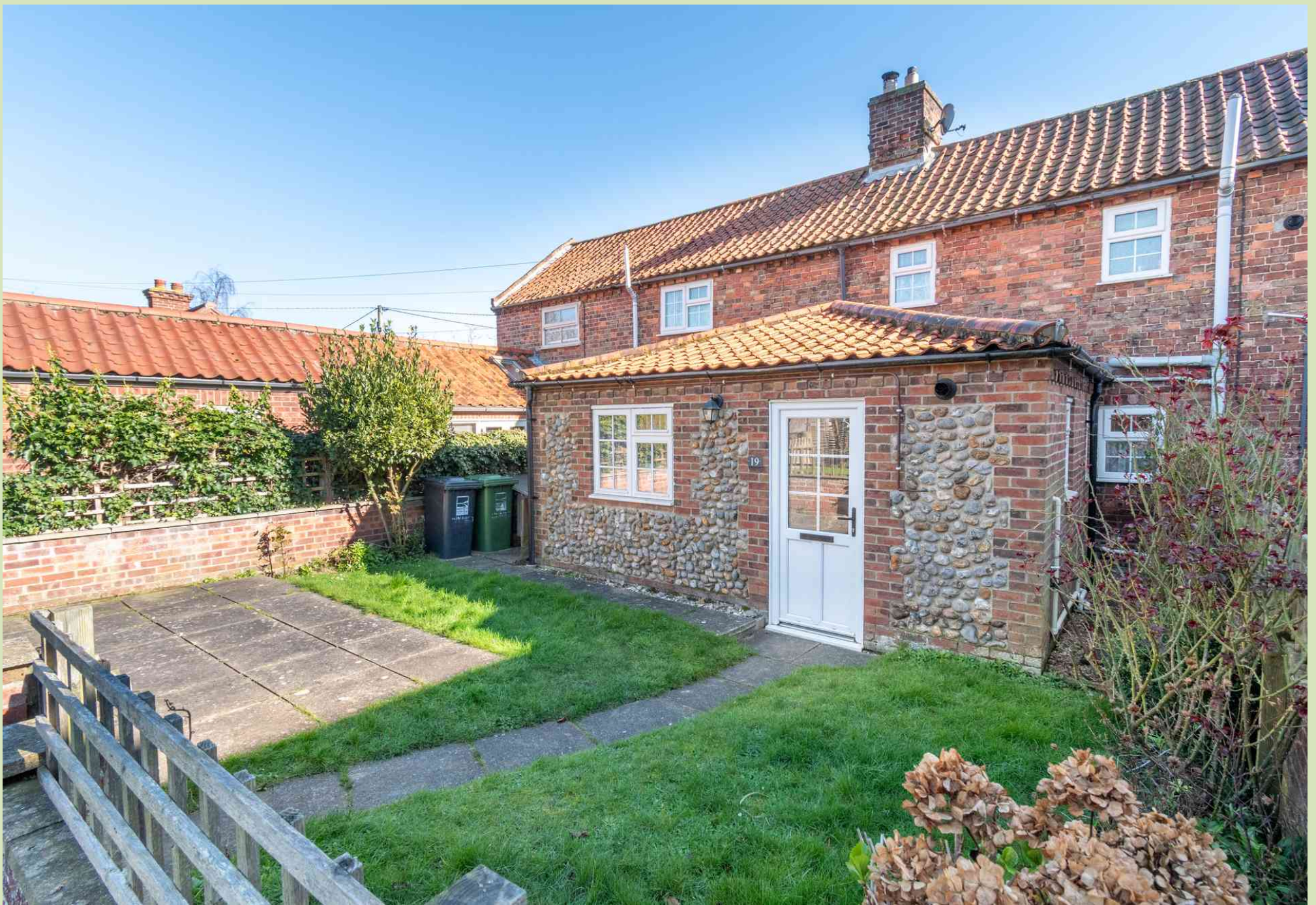
19/21 Park Road, Wells-next-the-Sea Guide Price £375,000