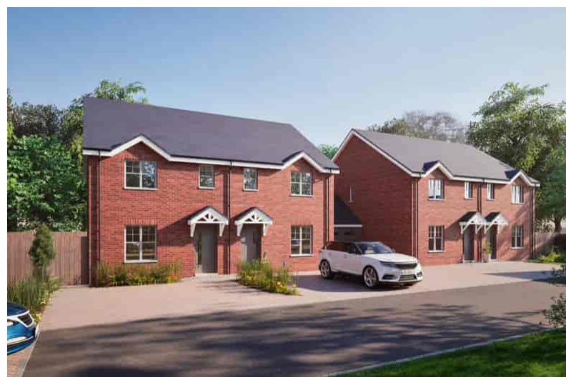
• Brand new 3 bedroom semi detached property • En-suite shower room to master bedroom • Downstairs cloakroom • Architects certificate • Solar panels • car port