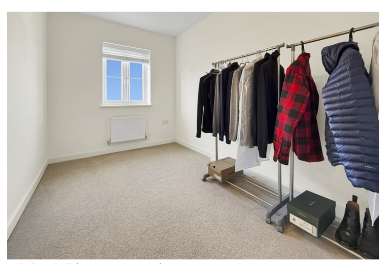
12'0" x 7' 2" (3.66m x 2.18m)