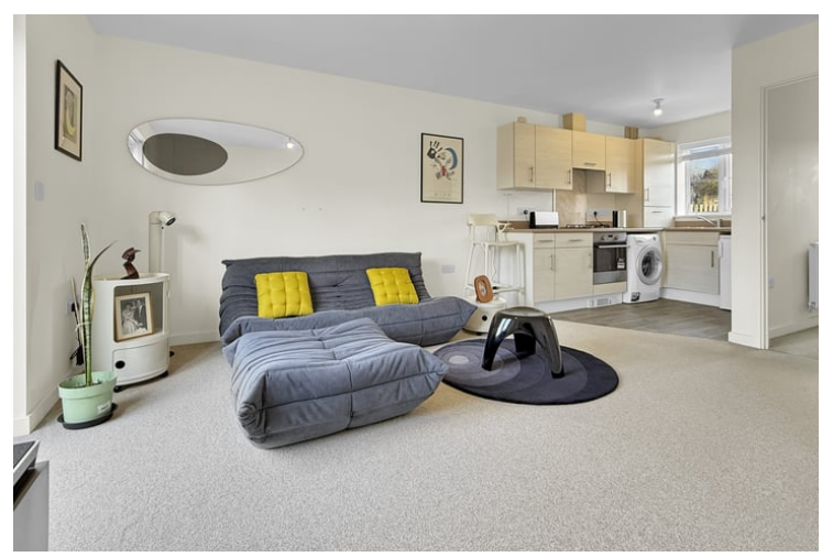
21' 5" x 14' 0" (6.53m x 4.27m)