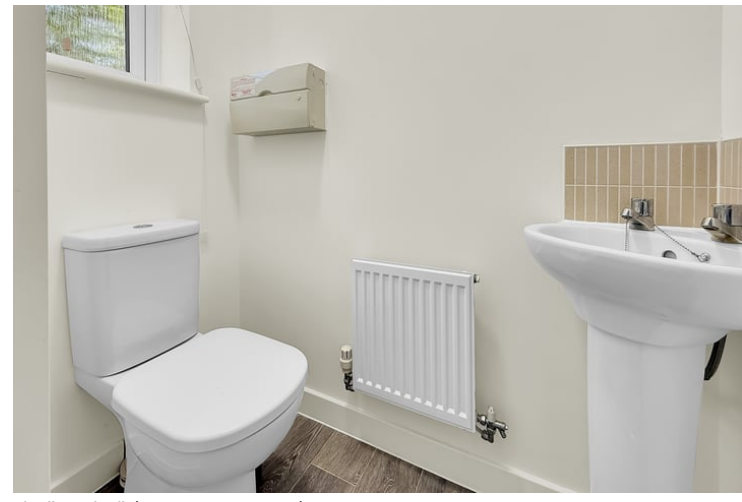
5' 1" x 2' 7" (1.55m x 0.79m)