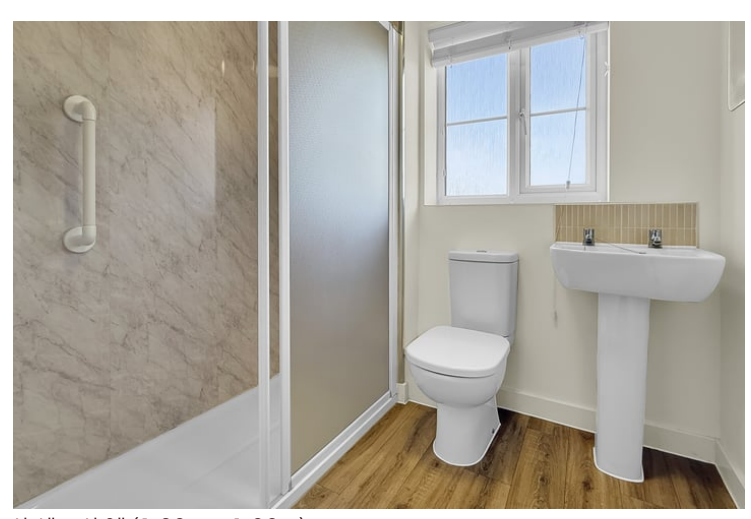
6'6" x 6'0" (1.98m x 1.83m)