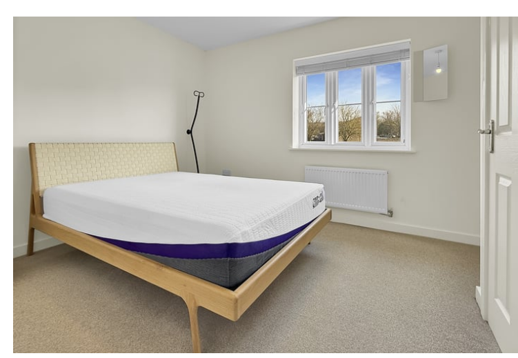
14' 0" x 9' 2" (4.27m x 2.79m)