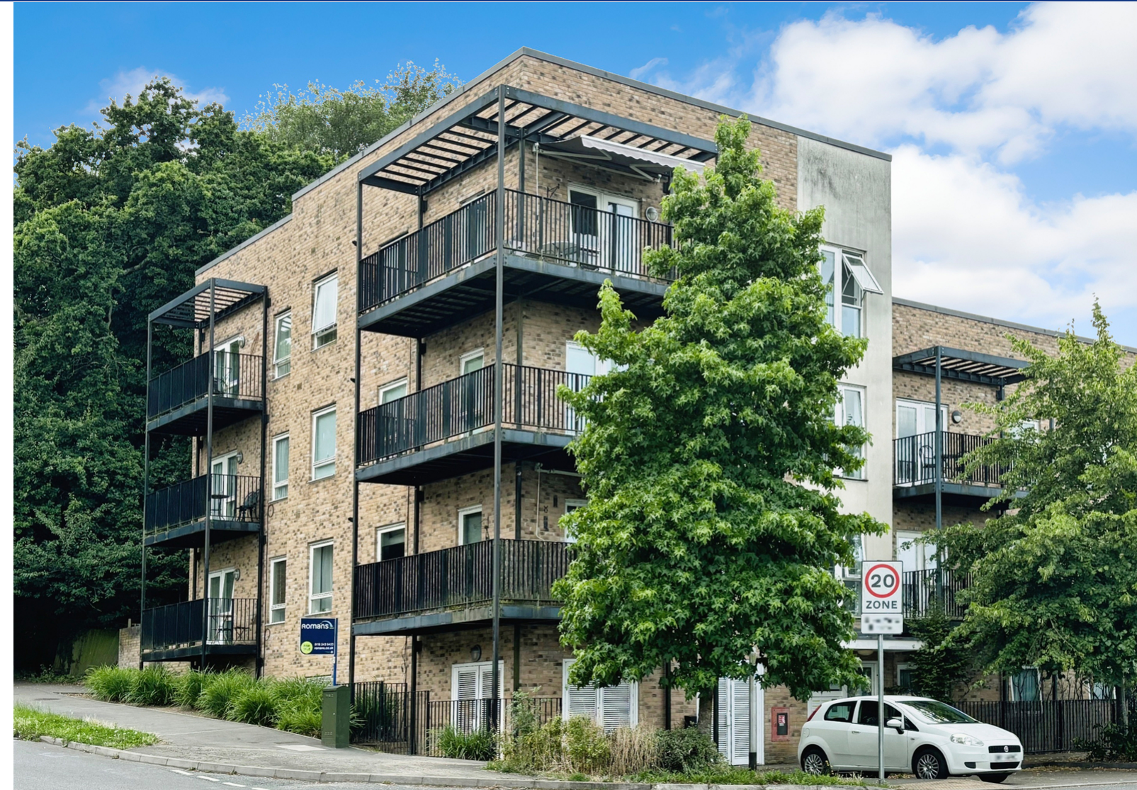
Tay Road, Tilehurst, Reading, Berkshire. RG30.