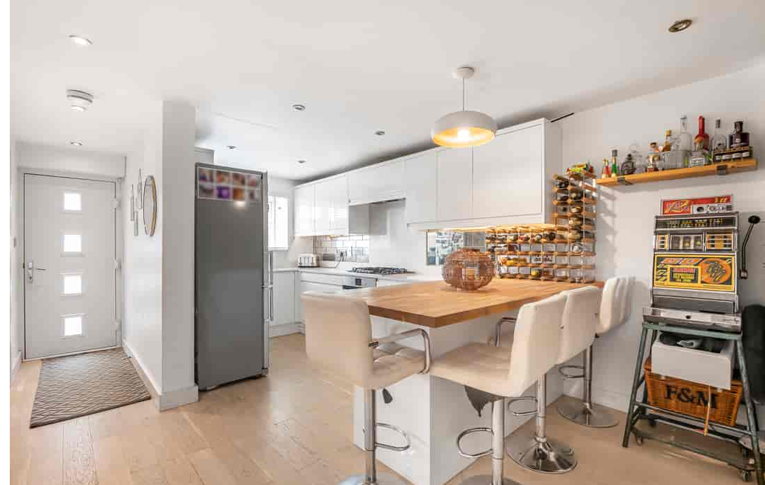
7 Kingsley Drive, Marlow, Buckinghamshire SL7 3QR £625,000 - Freehold