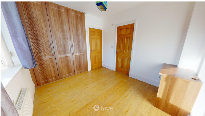
Jack and Jill Bathroom