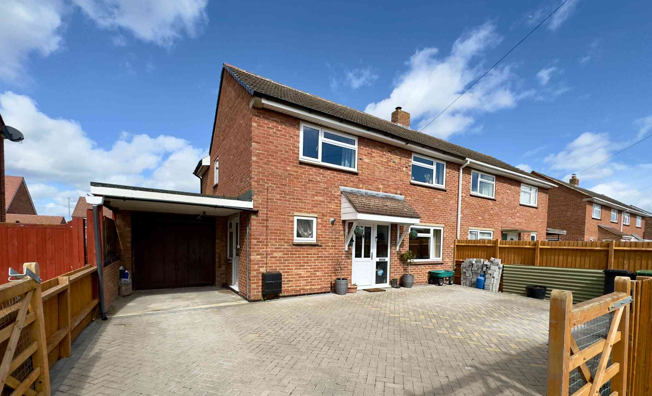
72 North Drive, Grove, Wantage OX12 7PN Oxfordshire, £400,000