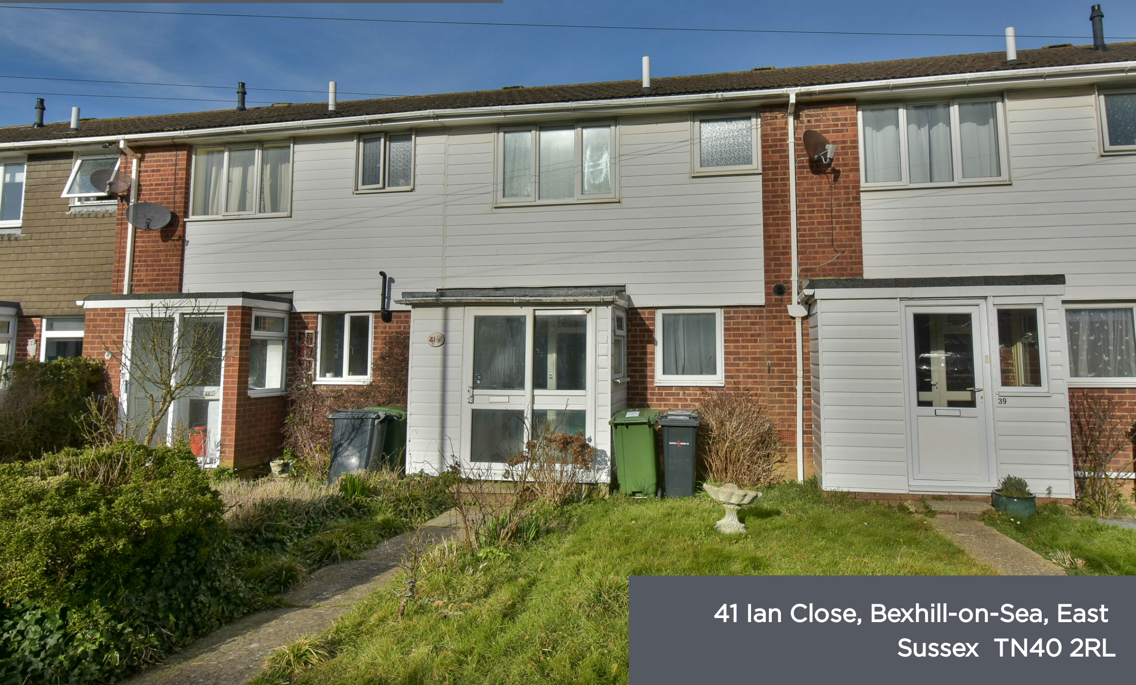
41 Ian Close, Bexhill-on-Sea, East Sussex TN40 2RL