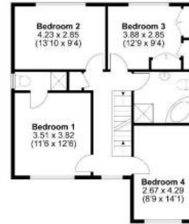
First Floor Approx. 68.8sqm (741sqft)