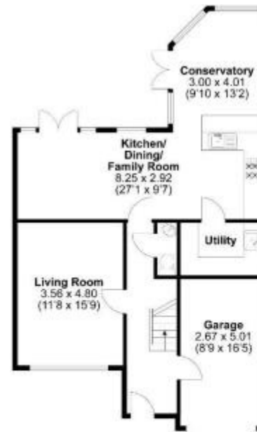
Ground Floor Approx. 84.4sqm (908sqft)