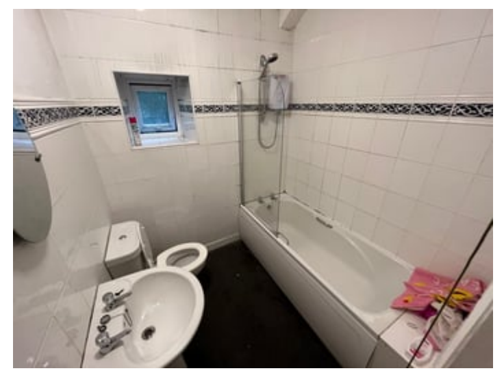
6' 3" x 5' 9" (1.91m x 1.75m) comprising WC, wash hand basin, bath with Aqua shoer over and screen, part tiled.