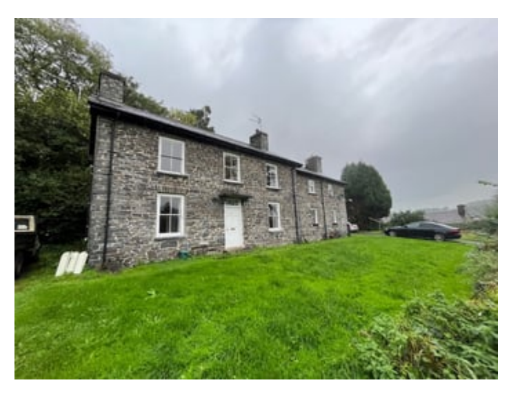
TANCASTELL NO 1.

The farmhouses which are in need of some modernisation provide the following accommodation. All room dimensions are approximate. All images have been taken with a wide angle lens digital camera.