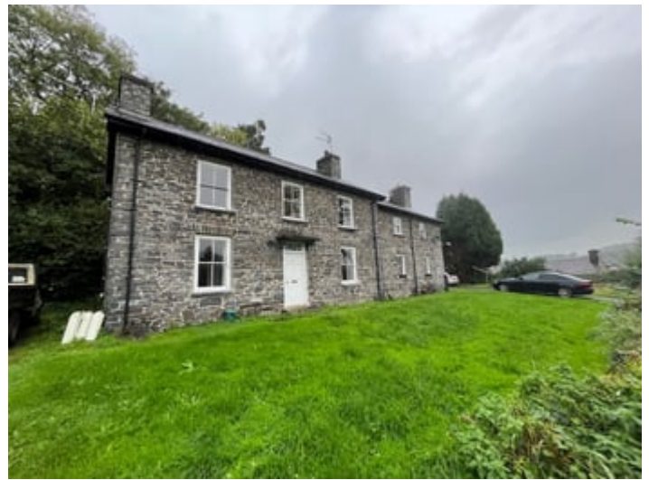
TANCASTELL NO 1.