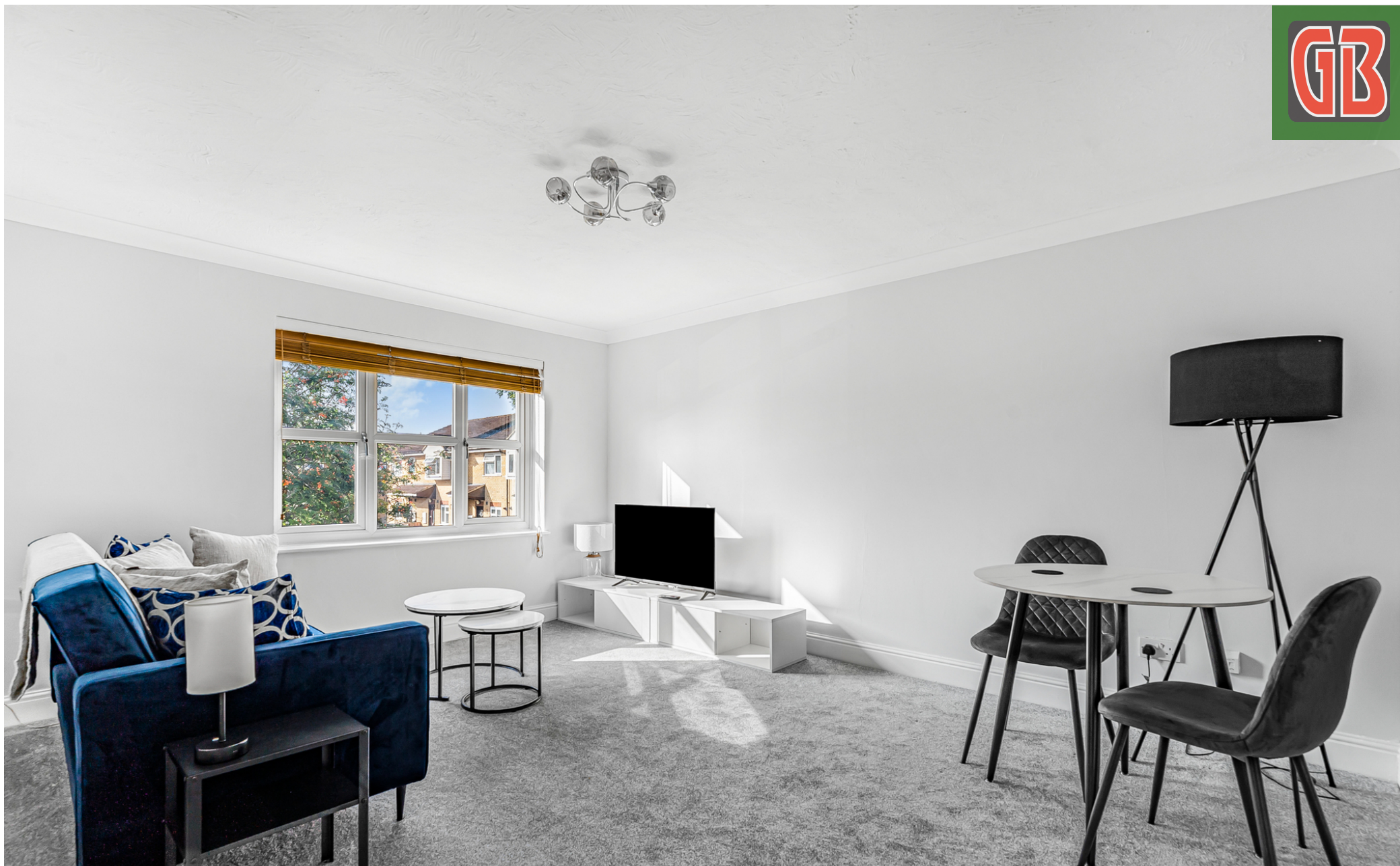
22 Sweeps Ditch Close, Staines-upon-Thames, Surrey. TW18 2RU. 1 Bedroom Apartment - £235,000 Leasehold