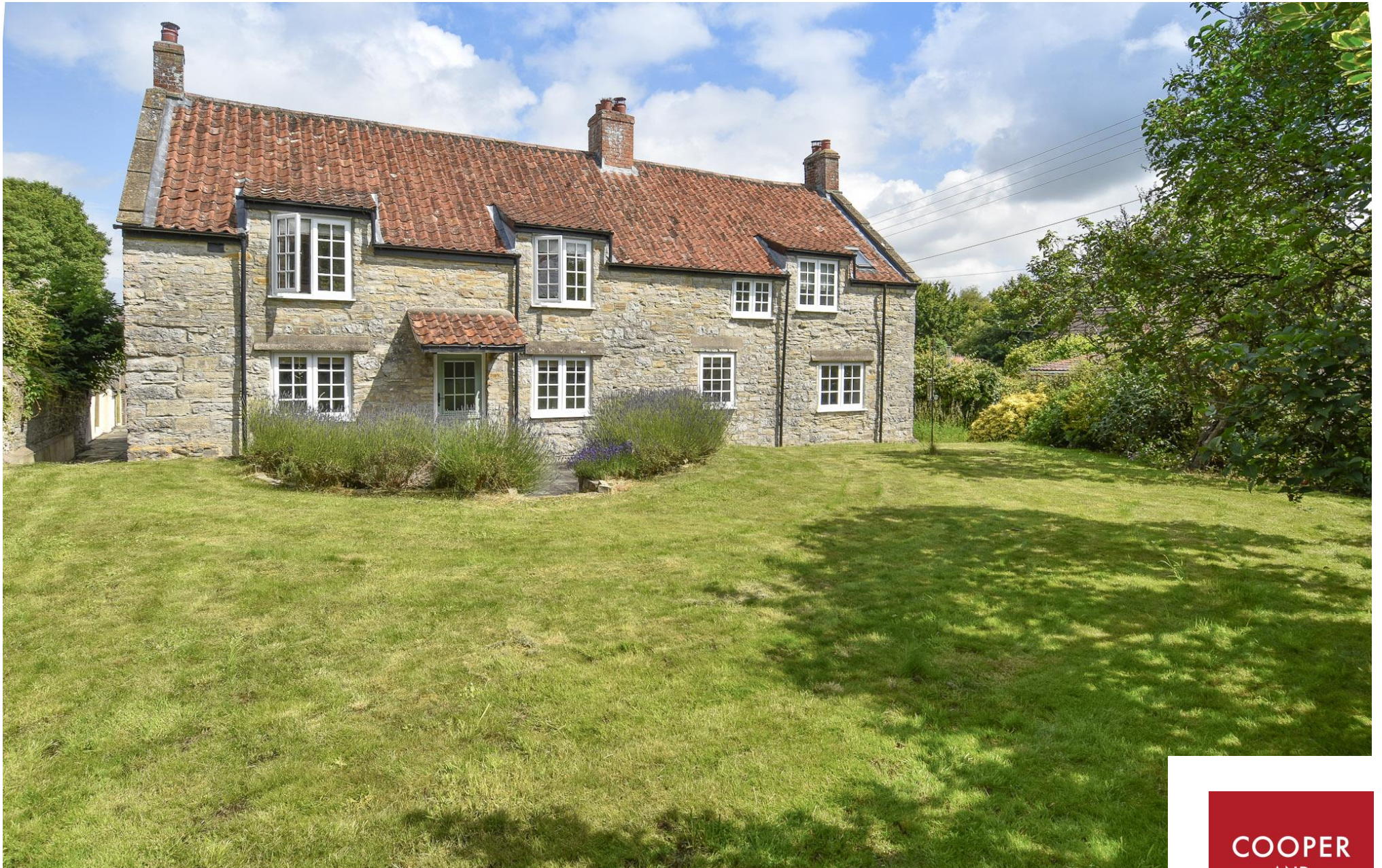
Ivy Cottage, The Ford, Blackford BS28 4NU