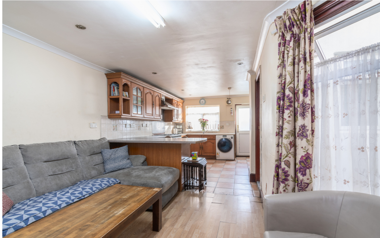
18 Sibley Grove, Manor Park, London. E12 6SE.