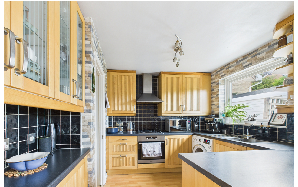
Elm Tree Avenue, Belper, Derbyshire DE56 0NL £235,000 - Freehold