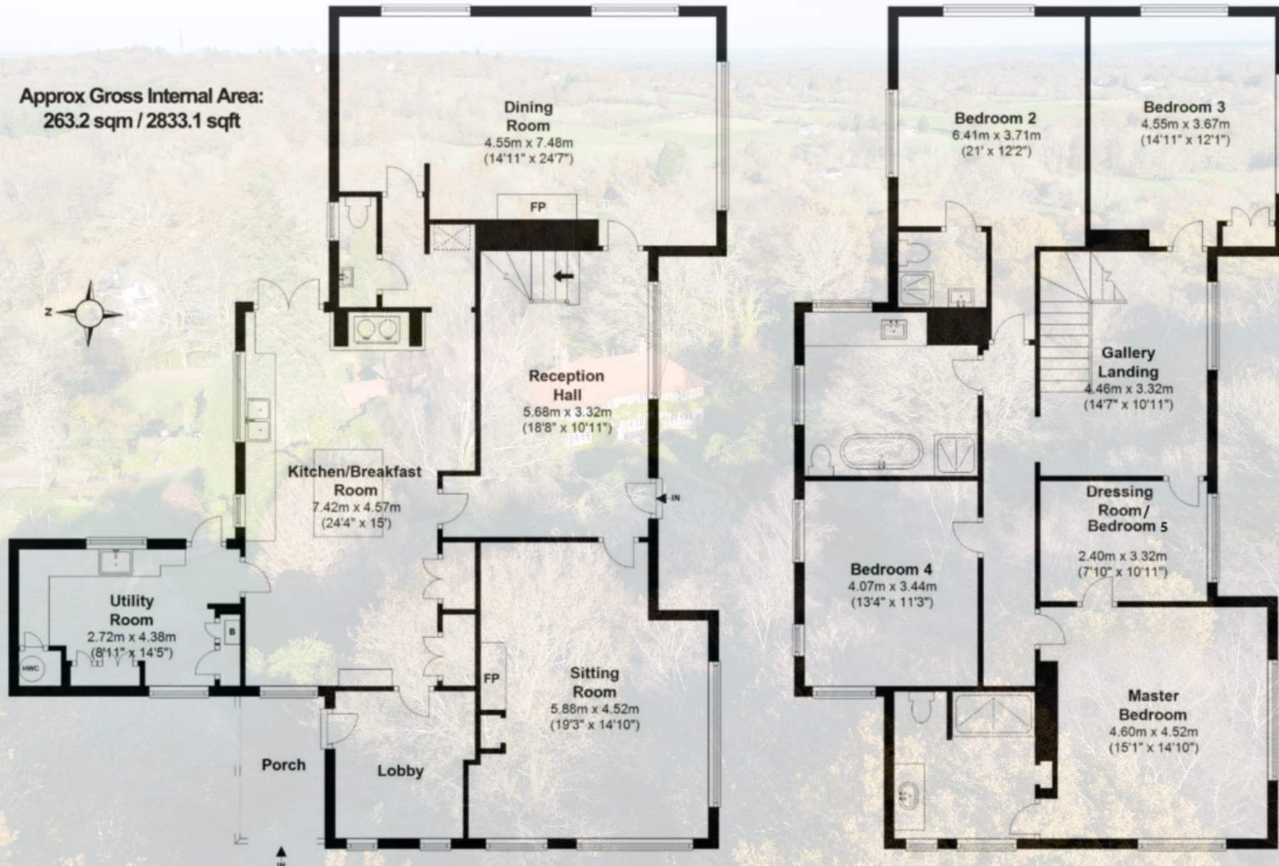
Illustration for identification purposes only; measurements are approximate, not to scale. Plan produced using PlanUp.

Approx Gross Internal Area: 263.2 sqm / 2833.1 sqft