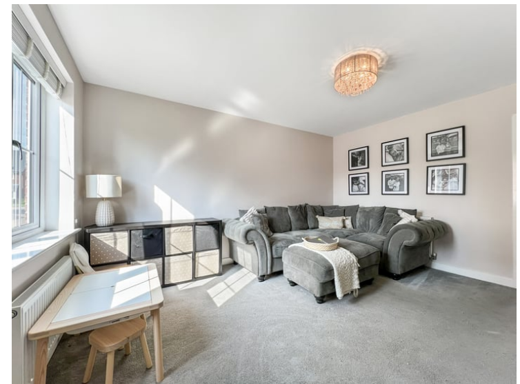
4.29m x 3.61m (14' 1" x 11' 10")