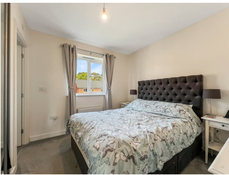
2.90m x 2.69m (9' 6" x 8' 10")