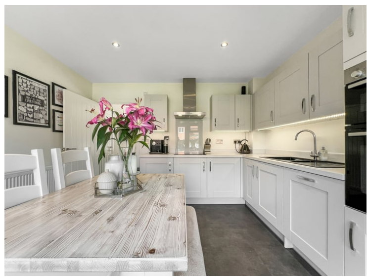
3.91m x 3.64m (12' 10" x 11' 11")