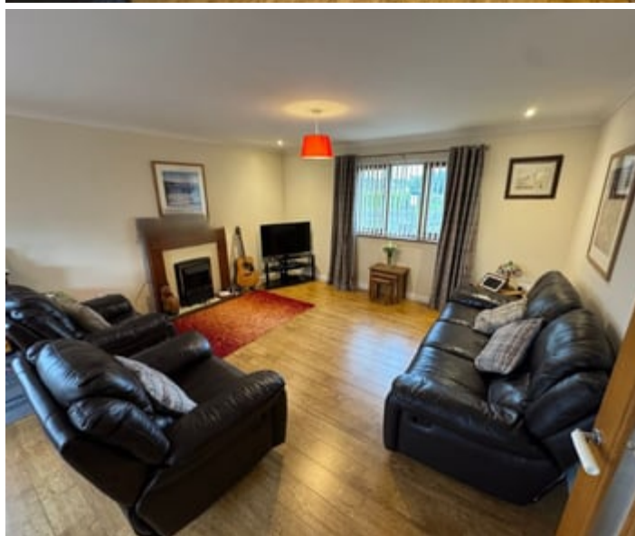
14' 4" x 23' 1" (4.37m x 7.04m) large family living room with window to front and side, sliding patio door to rear garden, electric fire with timber surround, wood effect flooring, multiple sockets.