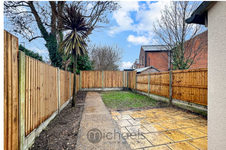
Outside, a charming and enclosed rear garden is on offer, featuring a patio area that is ideal for a bistro table and chairs, whilst the remainder is laid to lawn. A side tunnel/access leads to the front of the house, were the front garden is enclosed by a handsome cast iron rail.