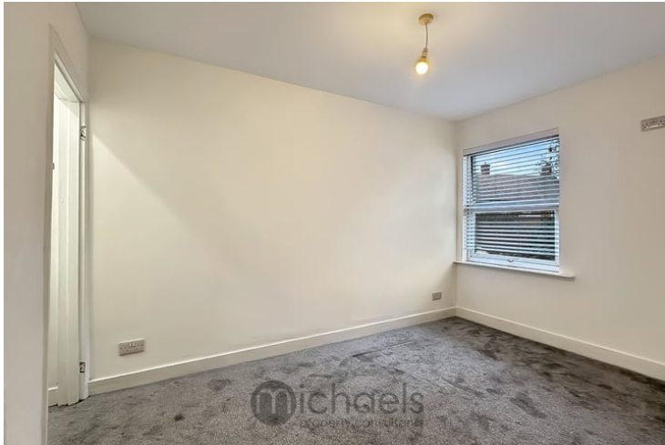
11' 9" x 8' 4" (3.58m x 2.54m) Window to rear aspect, wall mounted heater, over-stairs cupboard with sensor light