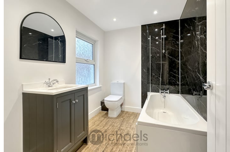
9' 1" x 6' 4" (2.77m x 1.93m) Window to sider aspect, wood effect flooring, vanity wash hand basin, panel bath with screen and shower over, W.C