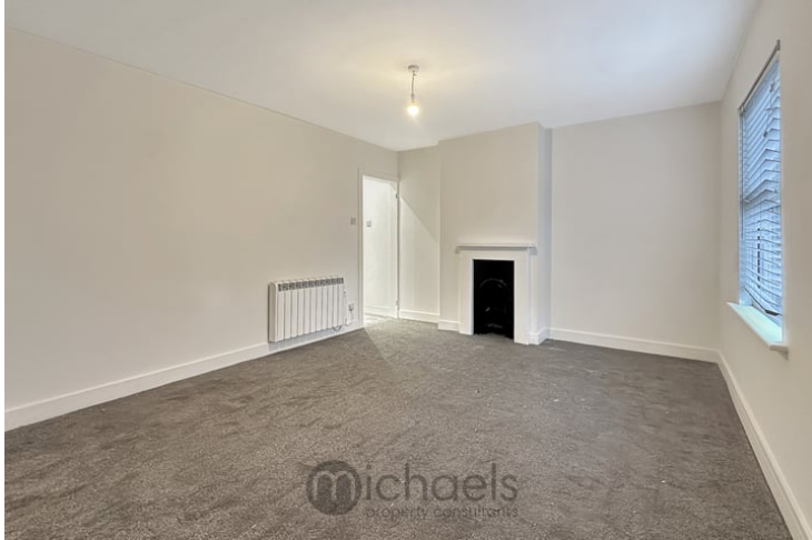
15' 6" x 12' 1" (4.72m x 3.68m) Window to front aspect, wall mounted heater