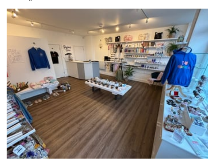
SHOP/OFFICE (SECOND IMAGE)

In total measuring 415m sq with large prominent display window, various electricity points, spot lighting, laminate flooring, electric wall heater.