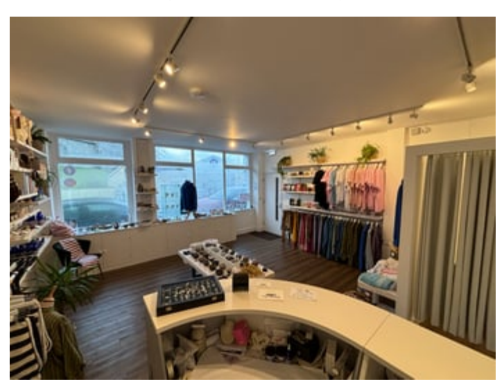
SHOP/OFFICE (THIRD IMAGE)