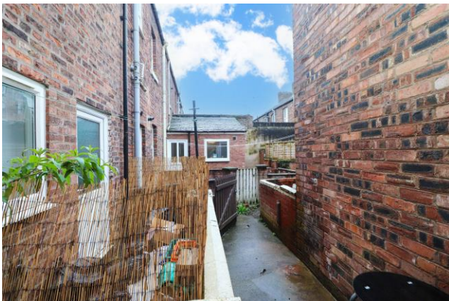
SHARED REAR YARD

OUTSIDE Shared rear yard and residents permit parking to the side.