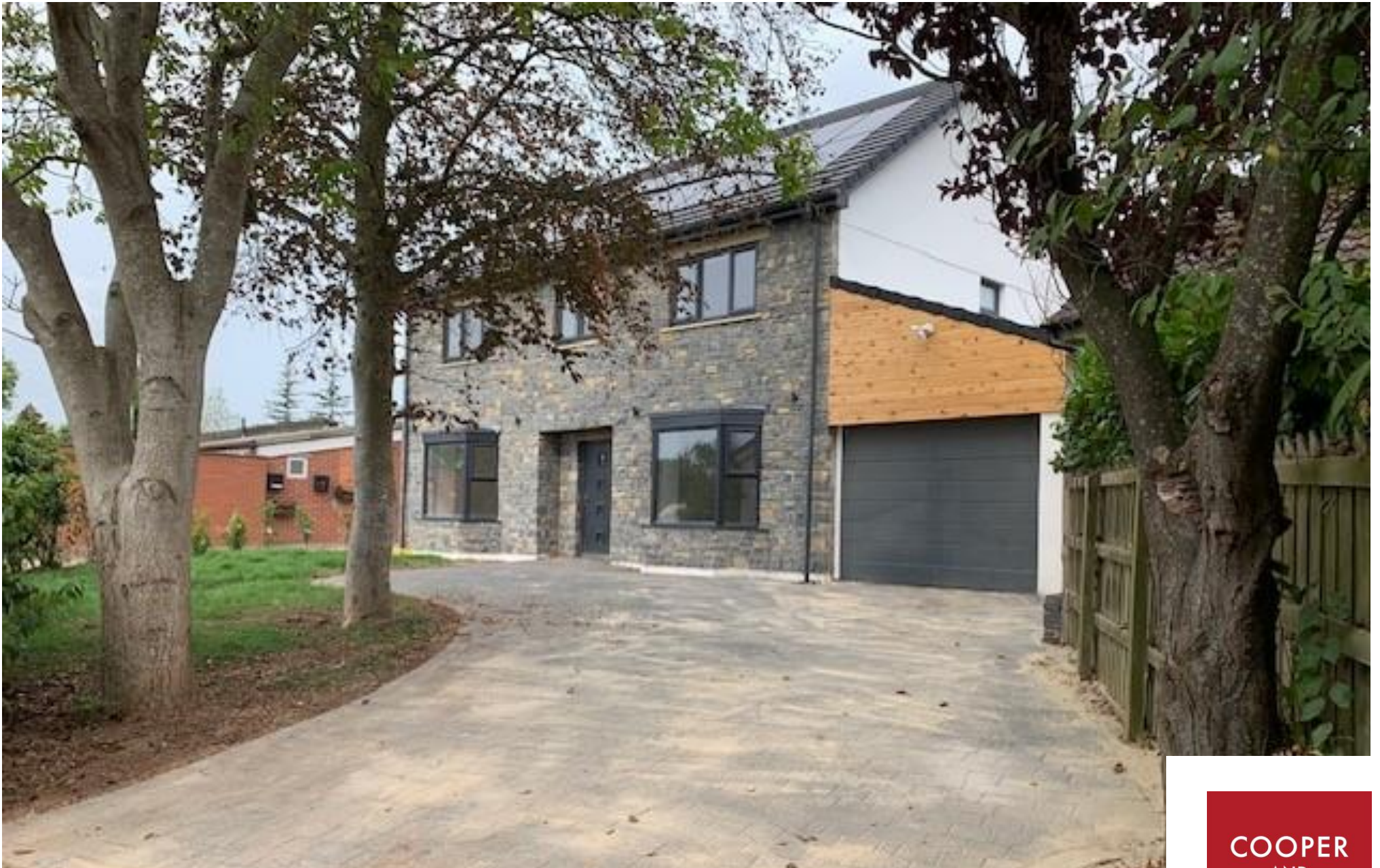
Underdown Cottage, Dark Lane, Coxley, BA5 1RF