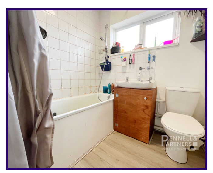
EPC Rating: E (53)

Viewings are highly advised, please contact our Sales Team to arrange a viewing or for further information.