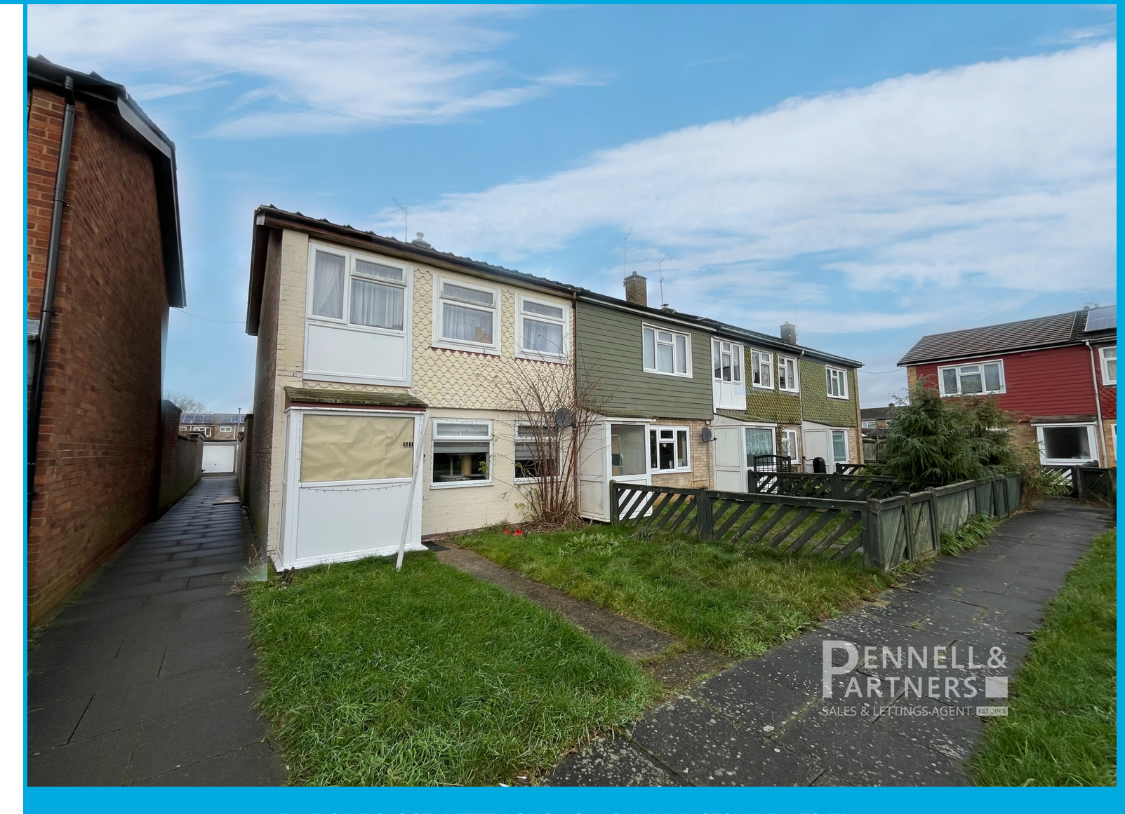
51 FLORE CLOSE, PETERBOROUGH, CAMBRIDGESHIRE. PE3 7AH